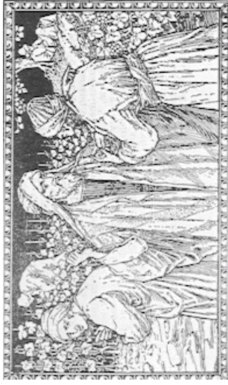
Go you also into my Vineyard