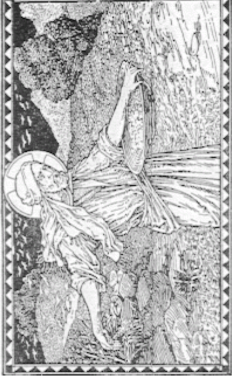
The seed is the word of God